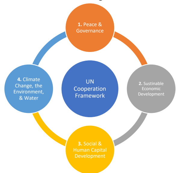
Figure 2: Cooperation Framework Strategic Priorities

In the absence of a formal national development planning framework against which to directly align the priorities and outcomes of the Cooperation Framework, an analysis of sectoral plans and consultations with Government and other counterparts ensures that the Cooperation Framework will contribute to national objectives.