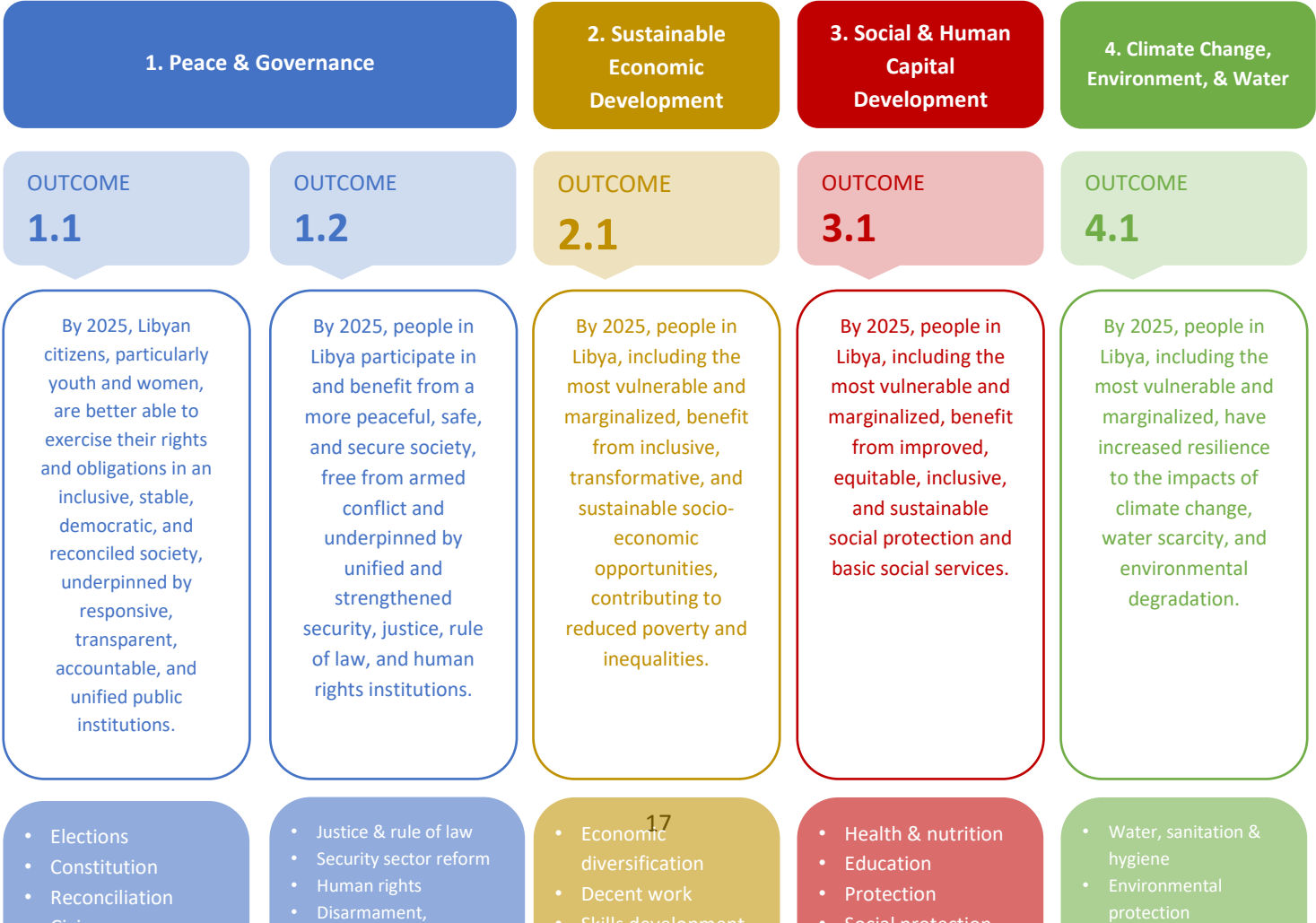
Figure 3: Cooperation Framework Theory of Change for progress towards the SDGs

It should be noted that Libya’s context makes it particularly vulnerable to multiple risks that can impede progress towards sustainable peace and development objectives, particularly political instability, insecurity, institutional fragmentation, weak governance capacity, geopolitical factors, weak economic performance, an overreliance on hydrocarbons, and climate change and environmental degradation. Special consideration will therefore be required to mitigate the potential impacts of these potential threats across all Cooperation Framework objectives (refer to the UN Common Country Analysis for more information).