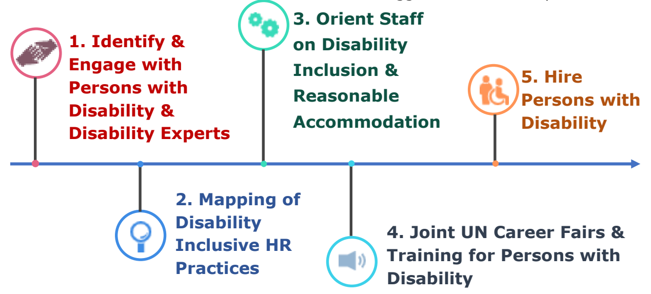
Exhibit 1: Inclusive HR Common Services in the suggested order of implementation

The common services are recommended to be implemented in sequence and would follow the order in Exhibit 1.