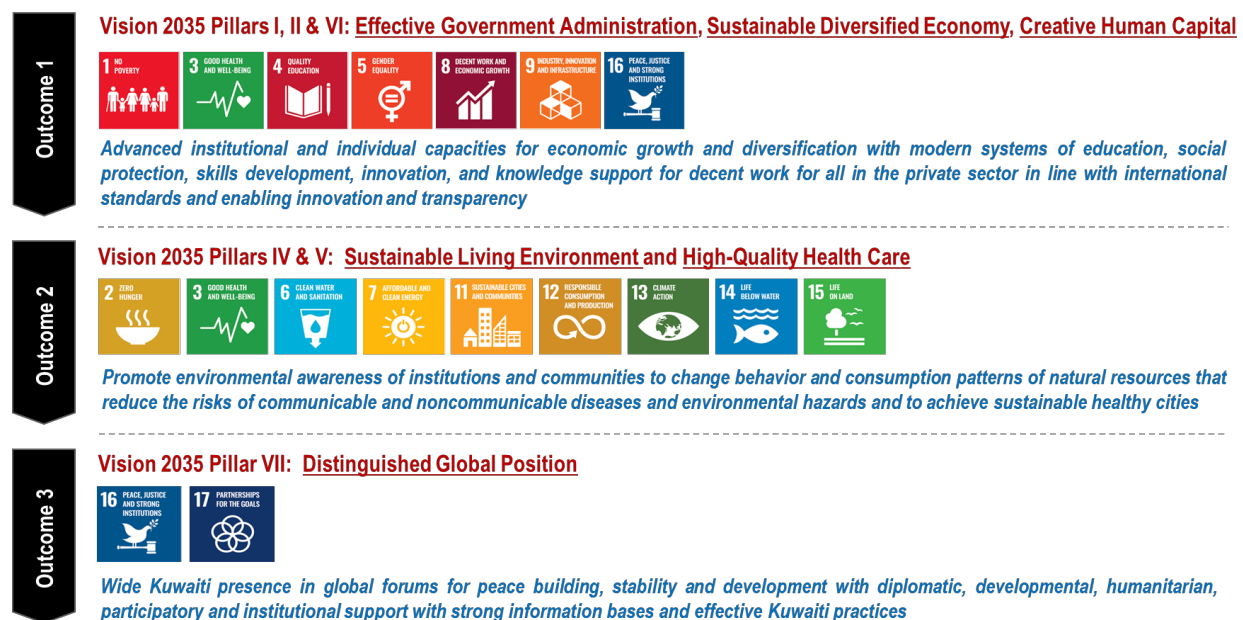
Figure 3. Three main outcomes of UN-Kuwait Cooperation Framework 2020-2025

The main focus areas of the SCF are fully aligned with the five themes and seven pillars that set in the country's long-term development plan: Diversify the economy, boost economic growth with a leading role for the private sector, reduce the size of the public sector and sharpen its regulatory and enabling roles, enhance education and human resource development, strengthen environmental conservation. In this context, the three main outcomes set in the SCF are: (1) the GoK and the UN cooperate to provide capacity and institutional support to further enhance policy, regulatory environment and early warning for economic shocks, particularly in the context of COVID-19 and beyond; (2) the SCF aims to promote awareness-raising of individuals and communities to increase compliance with urban, health and environmental policies and to enforce plans, laws and regulations; and (3) the cooperation between the UN institutions, the State institutions and the civil and human society is built on and expanded for Kuwait's diplomatic, developmental and humanitarian efforts.