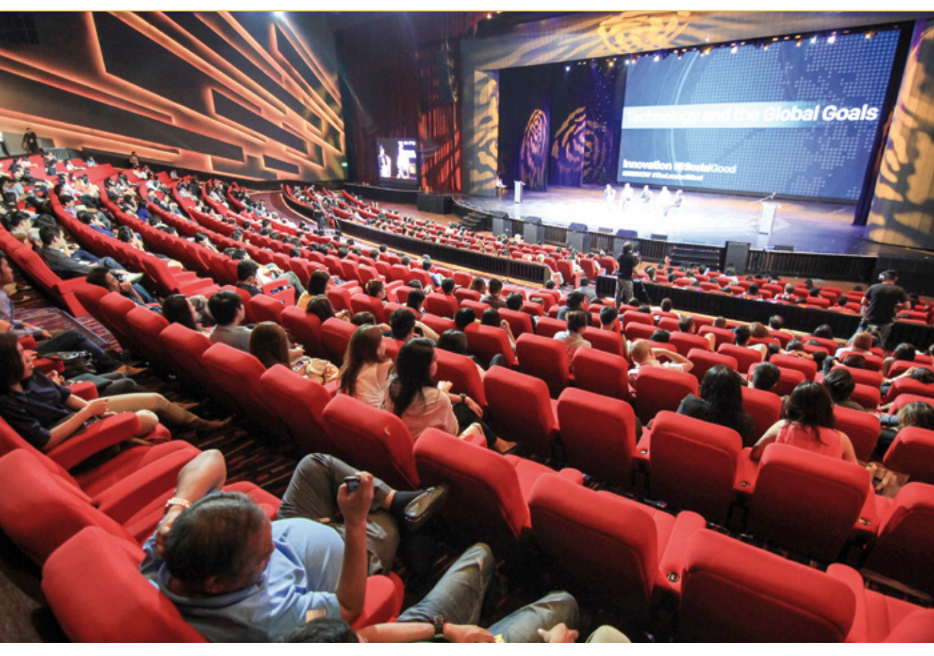
The SDGs were launched in the Philippines at the Social Good Summit in September 2015, organized by social news network Rappler with support from the UN.

In October 2015, NEDA, in coordination with the PSA and with UNDP support, conducted the First Technical Workshop on SDGs Indicators. This event was attended by 269 participants from various national government agencies, CSOs, academic institutions and the UNCT. Then in May 2016 the Second Technical Workshop on SDGs Indicators was convened with over 300 participants to inform the report by the Philippines to the Voluntary National Review for the HLPF in July. At these workshops, the initial list of SDG indicators was examined within the context of the country's development objectives, and relevant indicators that were not included in the list were identified. The participants also assessed whether data on the SDG indicators were available from existing data sources, and prioritized those that should be part of the country's core indicators. Building on such basic mapping activities, 231 global indicators were examined and prioritized in accordance with the national context, while 23 additional national indicators were presented for SDGs 2 (zero hunger), 3 (good health and well-being) and 5 (gender equality). The Department of Labor and Employment also initiated technical workshops with support from the ILO in May 2016 to identify and update indicators for SDG 8 (decent work and economic growth) and other goals covering elements of decent work. This led to a mapping of indicators in the Philippines covering decent work.