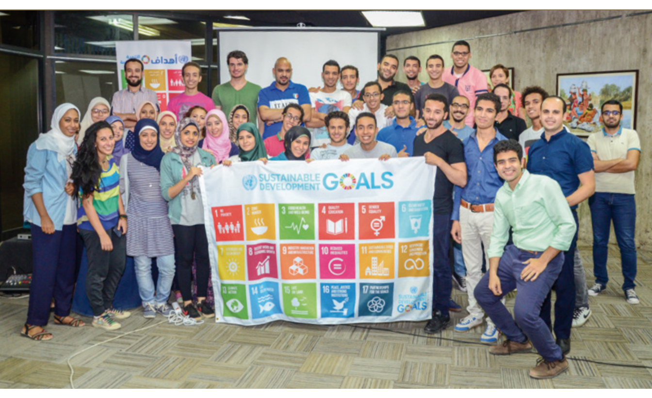
Egyptian youth came together to support the SDGs during the 'Open Code for Sustainable Development' camp in Cairo.