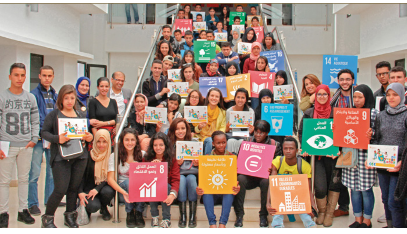
UNICEF and UNV facilitated a consultation with children and youth to hear their views on implementation of the SDGs in their country and contribute these ideas to the Moroccan Voluntary National Review at the HLPF in 2016.

The Economic and Social Council, the Ministry of Foreign Affairs and the UN system brought together CSOs and national institutions in the consultations. Discussions included how to support local authorities in the development, implementation and monitoring of the SDGs, and how to effectively engage children and youth and foster awareness and ownership of the 2030 Agenda. The role of CSOs in maintaining the public debate was also highlighted. UN entities such as UNDP, the United Nations Department for Economic and Social Affairs (UNDESA), UNESCO, UNV and the United Nations Economic and Social Commission for Western Asia (UNESCWA) proposed areas of policy support and tools at regional, national and subnational levels in support of contextualizing and accelerating the SDGs in Morocco. With a particular focus on children and youth, UNICEF and UNV organized sessions during and after the national consultations, leading to positive feedback that those sessions helped enhance the civic engagement of young people at the local level.