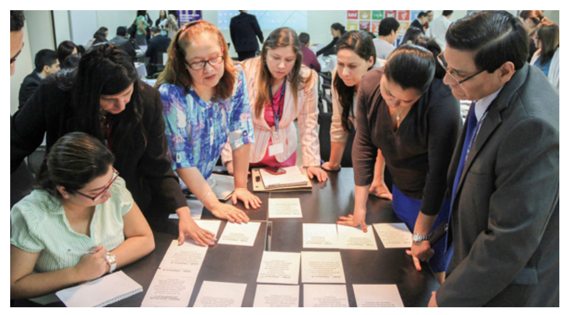
Salvadoran public servants identify the links between the SDGs and the national Five-Year Development Plan.

To overcome the monitoring and reporting challenges posed by the 2030 Agenda, the Technical and Planning Secretariat of the Presidency and the Ministry of Foreign Affairs have been working with the UN to review the complete list of SDG indicators, as a first step towards defining national targets. This work includes the development of a second series of workshops with Salvadoran public institutions, aiming at fostering multilateral dialogues on the issue and generating the seed for the creation and implementation of a one-of-its-kind national development agenda for the SDGs.