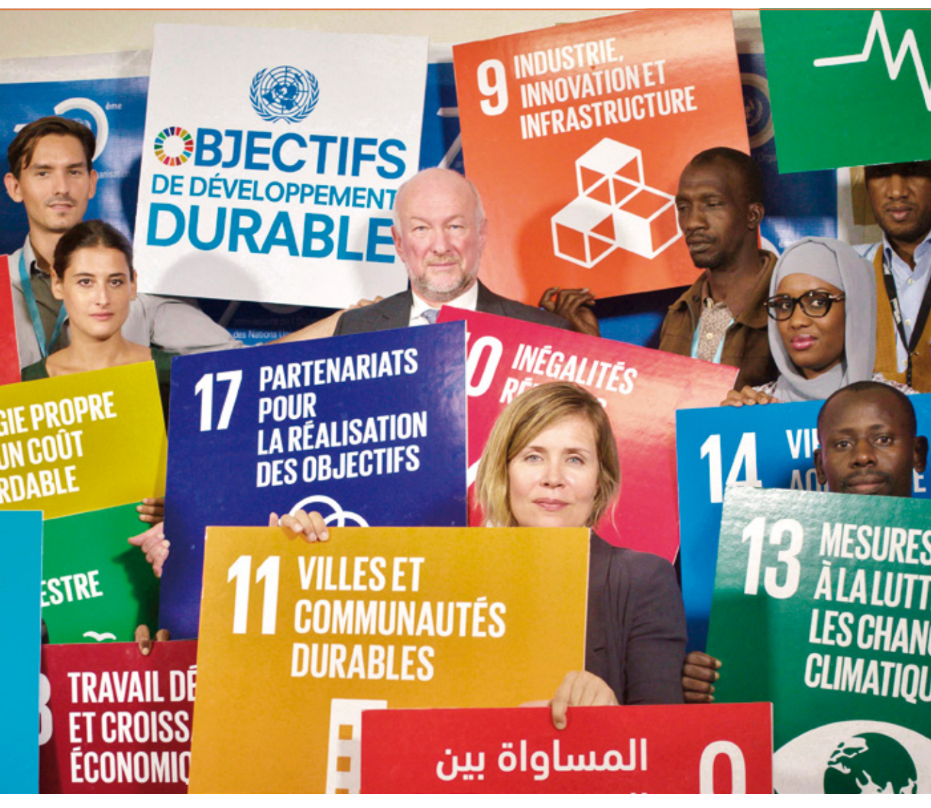
UNCT Mauritania, communicating on the SDGs, Nouakchott, Mauritania.

Furthermore, representatives of marginalized groups, such as the Association for Disabled, Blind and Visually Impaired People, have taken part in the work to mainstream the SDGs into the Strategy of Accelerated Growth and Shared Prosperity, including in awareness-raising workshops and technical work to prioritize the SDGs.