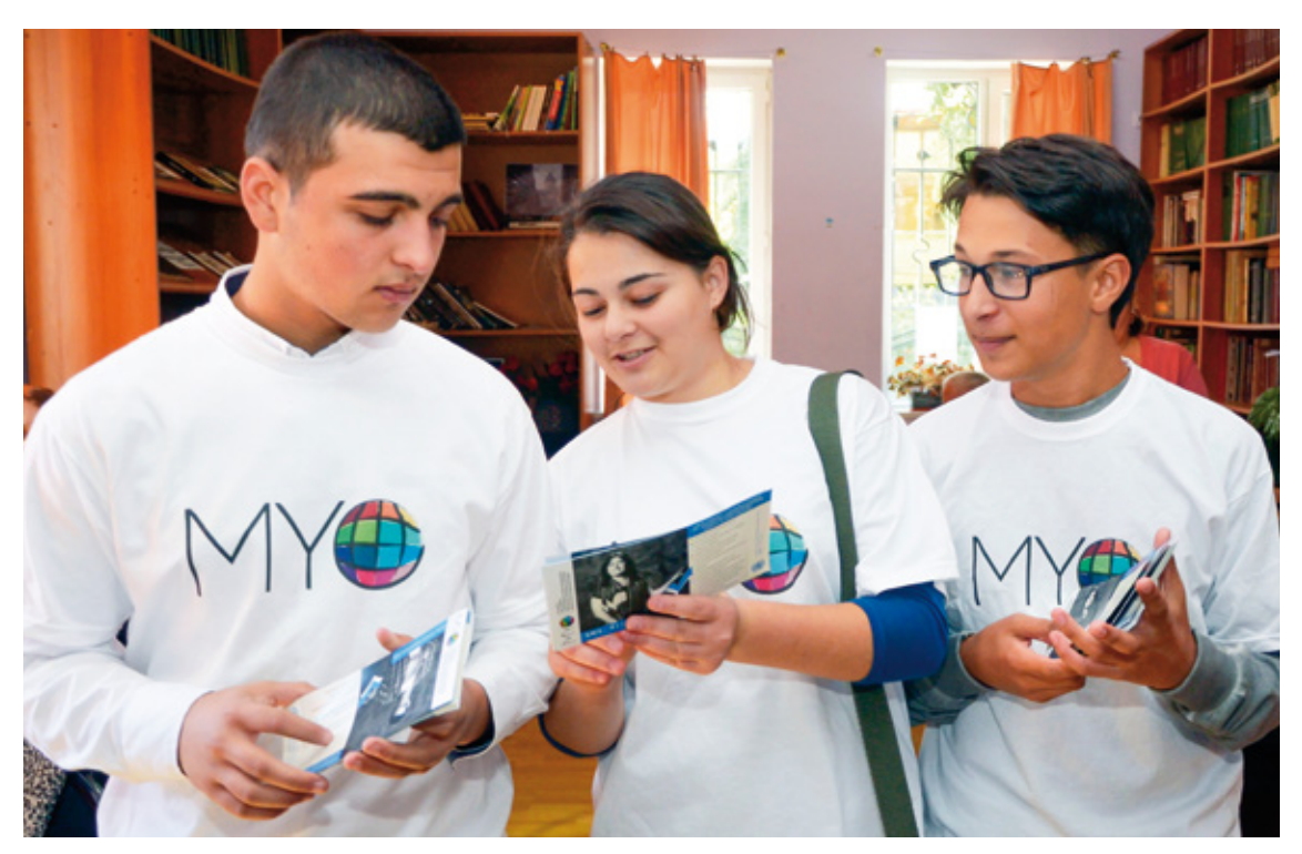
Students from different Georgian universities take part in the MY World information sessions in Mtskheta.

With the support of the National Statistics Office of Georgia (Geostat), a reliable information base has been analysed to set the baseline indicator for each target. Geostat has worked with the line ministries to collect the relevant data and analyse weaknesses of disaggregated statistics. As of early 2016, nearly 120 indicators have been identified as having baseline data. Still, the lack of statistical data remains a challenge to setting reliable quantitative indicators.