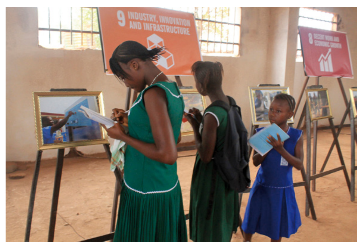
School girls in Sierra Leone ponder about SDG 9 (industry, innovation and infrastructure).

Lessons learned from the Ebola crisis and the collapse in international iron ore prices informed the development of the National Ebola Recovery Strategy/Presidential Recovery Priorities (2015–2017). The objective is to ensure that the country maintains zero cases of Ebola while 'building back better' national systems for resilience and national development, including preparedness to face future shocks and epidemics. The national strategy comprises seven presidential priority sectors: health, education, social protection, private sector development, water, energy and governance. Implementation of the first phase ended in March 2016, and the second phase started in April 2016. Discussions are under way for the presidential priorities to integrate the SDGs.