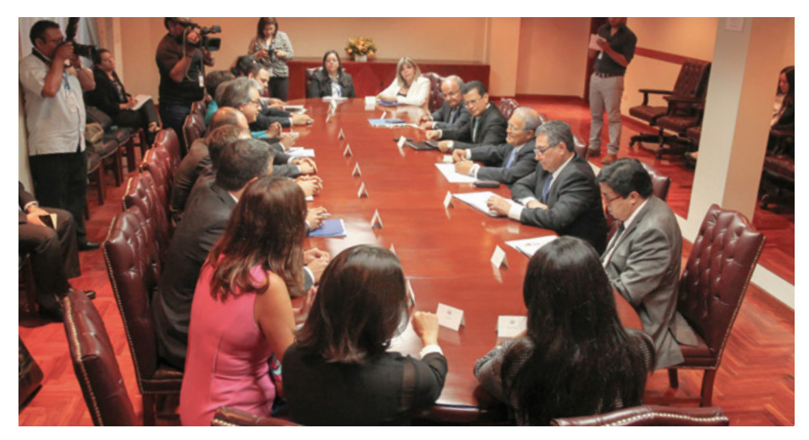
President Salvador Sanchez Cerén meets with representatives of the UN system in El Salvador, prior to the series of SDG workshops for public servants.

The current Five-Year Development Plan (2014–2019) has already been studied and analysed in relation to the 2030 Agenda and the SDGs. Among several similarities found, it is of particular interest to note that SDGs 8 (decent work and economic growth), 4 (quality education) and 16 (peace, justice and strong institutions) clearly embody the three main priorities defined in the Plan: (i) productive employment generated through sustained economic growth; (ii) inclusive and equitable education; and (iii) effective citizen security.