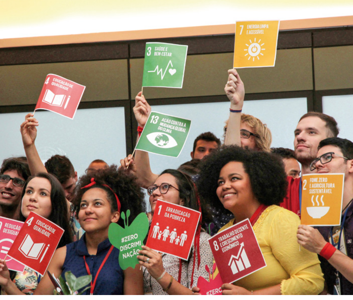
SDG flag-raising ceremony at UN House in Brasilia, Brazil.

The Government of Brazil has been a long-standing champion of sustainable development as the host of the 1992 Earth Summit and the 2012 Rio+20 Conference. The Brazilian Institute of Geography and Statistics (IBGE) has represented the Mercosur countries and Chile on the Inter-Agency and Expert Group on Sustainable Development Indicators and has been elected as the new Chair of the UN Statistical Commission, actively contributing to the task of developing the SDG indicators at the global level. Both IBGE and the Interministerial Working Group on the Post-2015 Development Agenda — encompassing 27 ministries and bodies of federal administration — have undertaken consultations with different stakeholders to reflect Brazil's contribution to implementing the SDGs.