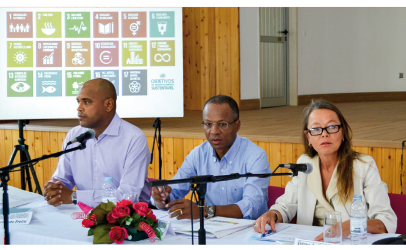
Cabo Verde Government retreat in June 2016 to discuss the SDGs and how to integrate them into national policies and strategies (from left to right: President of the Council of Ministers and Minister for Parliamentary Affairs, the Prime Minister and the UN Resident Coordinator).