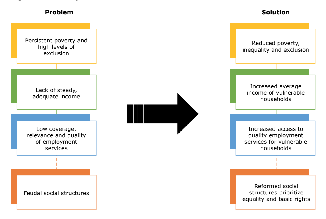
Figure 2: Turning a branch of a problem tree into a solution tree

Envisaged solutions should be consistent with the criteria identified to focus the work of the UNCT in Step 1. The solution tree should also include how key partners are contributing to the development change, as identified in the funding to financing analysis. When articulating the solutions proposed by the UN in the country context, it is useful to demonstrate that they respond to the parameters of: